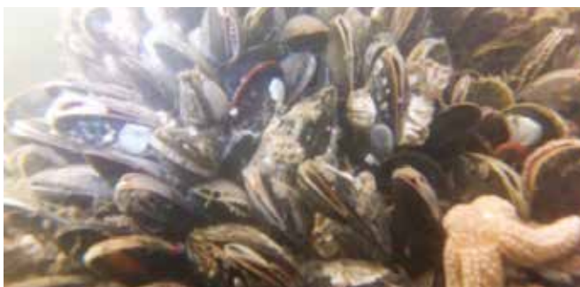
Bio-fouling of turbine tower