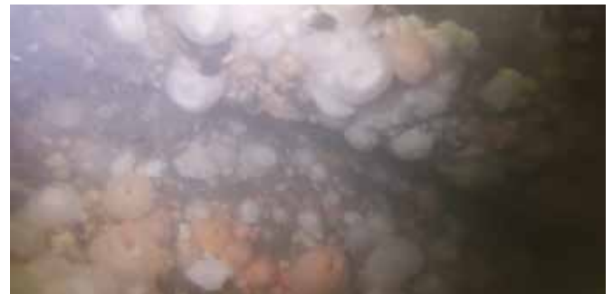
Bio-fouling of J-tubes