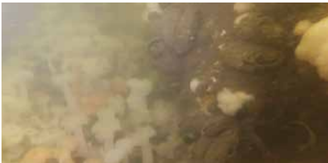
Colonisation at base of turbine

Natural Power has provided consenting and operation services to E.ON's Robin Rigg Offshore Wind Farm, in the Solway Firth, including managing the Environmental Statement and the Marine Environment Monitoring Plan. As part of the services undertaken, Natural Power has utilised drop down video cameras and micro-ROVs fitted with laser scaling systems to investigate and assess the level of biofouling on foundation structures, as well as levels of corrosion on sacrificial anodes, for project engineers. A particular focus was on gathering colonisation data from key structural junctures to aid in effective planning of operation and maintenance procedures.