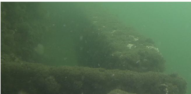
Inspection of sacrificial anodes