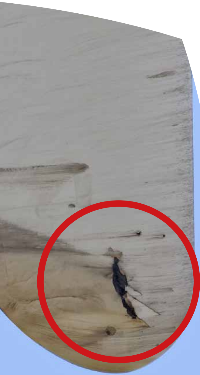
HD blade inspection close-up

Our engineers deliver inspections through specialist training and market leading technology.