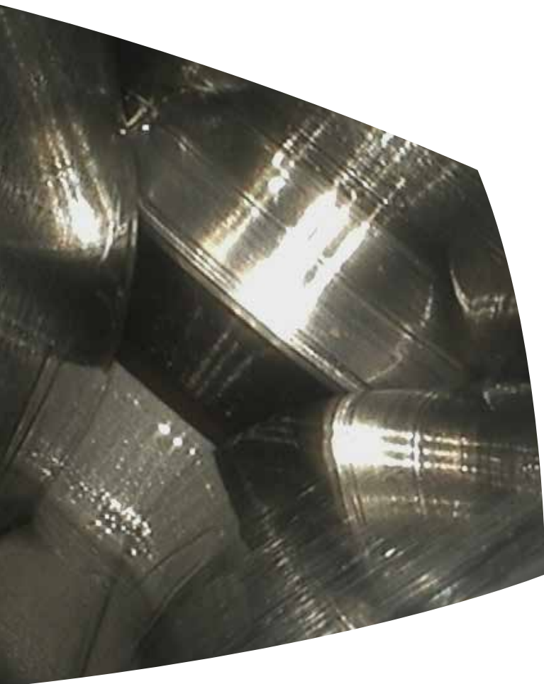
Visible evidence of abrasive wear on bearing roller and race surfaces