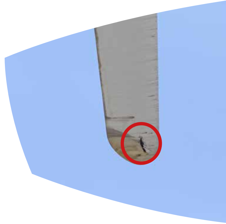
HD blade inspection